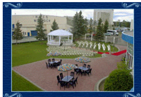
Chateau Louis Hotel Courtyard outside the banquet hall.

We are looking forward to seeing you there. Tickets for the banquet are $55/each. For more information please see our Banquet page on our website.