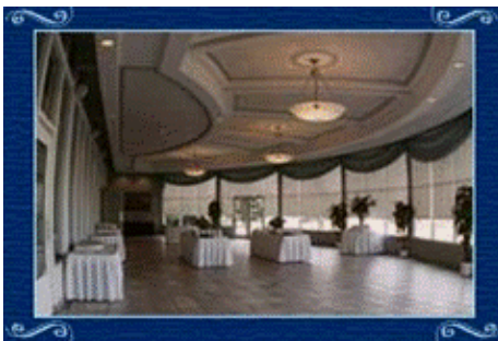
Chateau Louis Hotel Banquet Hall Gallery

House wines will be on the table for your enjoyment to accompany a buffet menu to remember. Such dishes as: Alberta Prime Rib, Lemon Chicken Breast, Baked Salmon, Spinach Lasagna, Baby Red Potatoes, Seasonal Vegetables, Caesar, Spinach and Greek Salads, Seasonal Fruit, Cheeses, Cold Meats